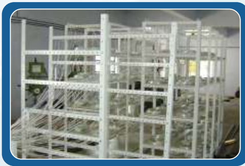
Roving Guide Stand