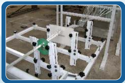
Preform Guide Stand