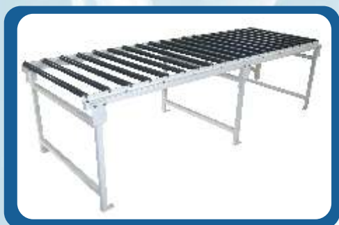
Section Conveyor Roller Table