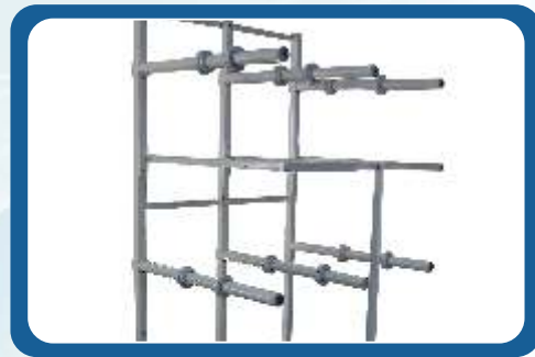
Mat Roll Stand