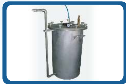
Pressure Injection System