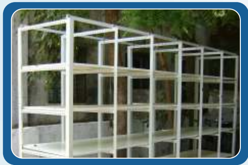
Creel Stand / Glass Roving Stand